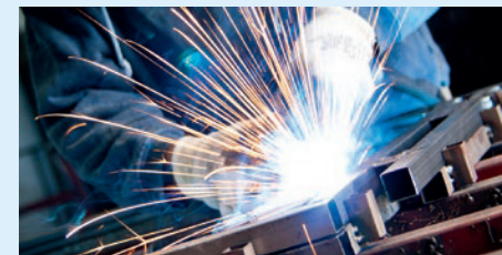
AIR POLLUTION CONTROL

Viledon® is a registered and protected trademark of Carl Freudenberg KG. © Freudenberg Filtration Technologies GmbH & Co. KG This document provides non-binding information. Freudenberg Filtration Technologies GmbH & Co. KG does not accept any liability for the completeness and correctness of the contents. Liability and warranty shall be governed solely by the provisions of the underlying delivery relationships.